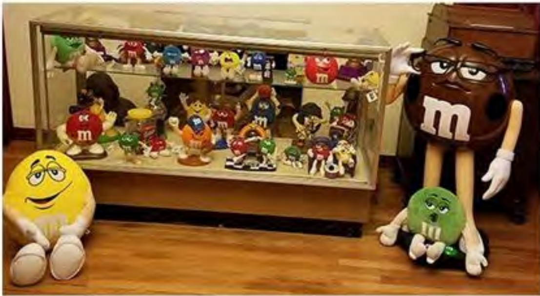
NOW ON DISPLAY