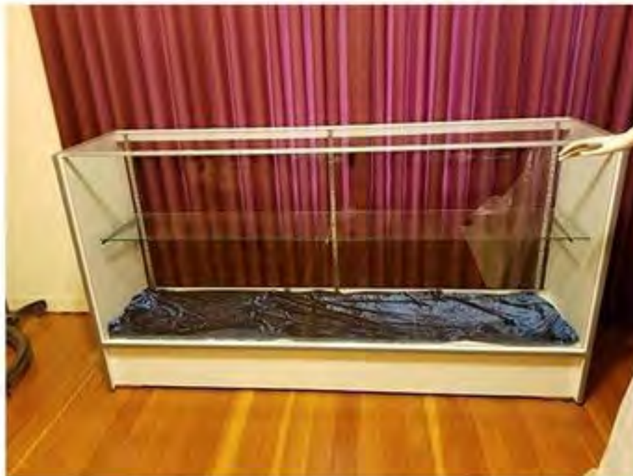
WAITING FOR YOUR COLLECTION